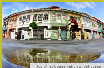
Joo Chiat Conservation Shophouses