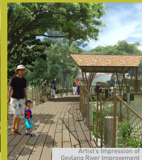
Artist's Impression of Geylang River Improvement

For more information and photo credits, visit the Draft Master Plan 2013 exhibition website at www.ura.gov.sg/MS/DMP2013 .