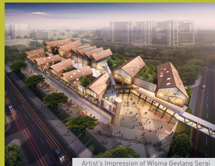
Artist's Impression of Wisma Geylang Serai