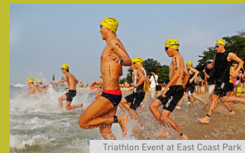
Triathlon Event at East Coast Park