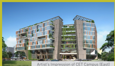
Artist's Impression of CET Campus (East)