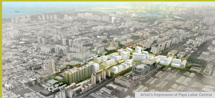
Artist's Impression of Paya Lebar Central