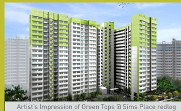
Artist's Impression of Green Tops @ Sims Place redlog